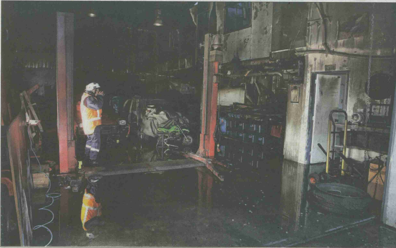
FIRE: Firefighters (above and top) at a business which has been destroyed by fire in Judea.