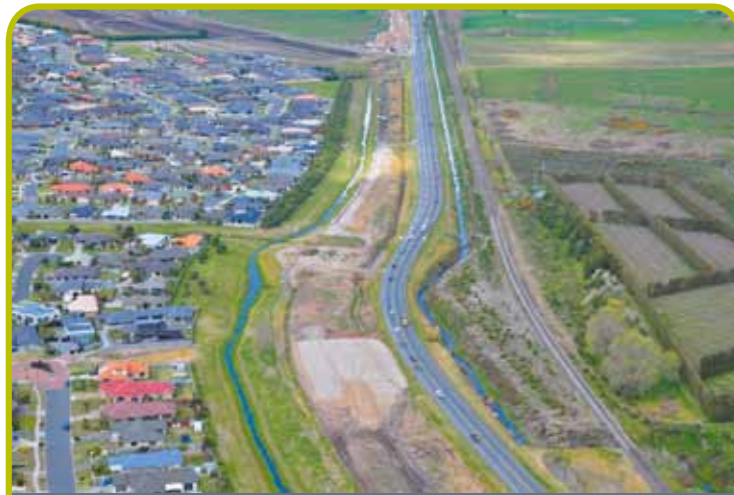
1 SH2 - trial embankment at the Maranui Swale, Bruce Road top left hand corner