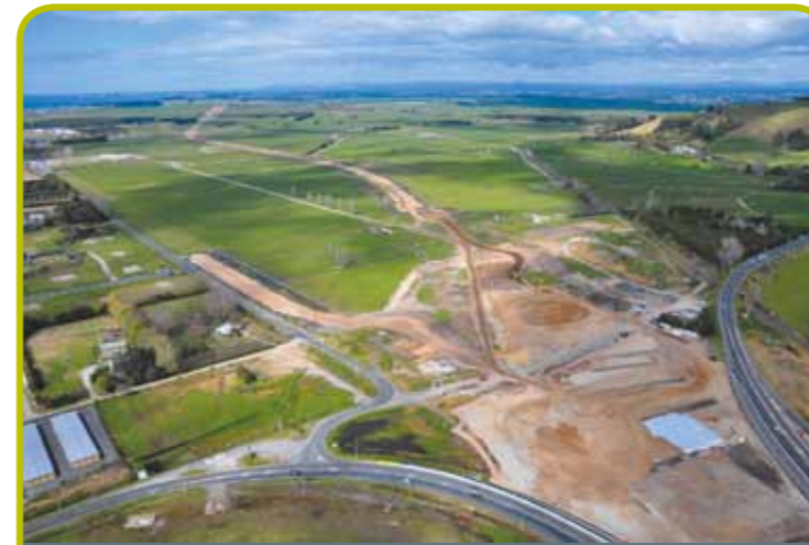
3 SH2 / Domain Road, TEL alignment heading east towards Parton Road