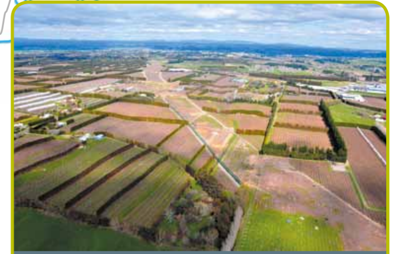
8 Kiwifruit orchard reconfiguration at Paengaroa end of TEL