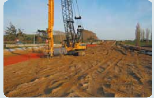
Over 15,000 wicks will be installed alongside SH2 to help drain the water content from the soft soil below.

From now until the end of the project construction activity will continue along SH2 and the NZ Transport Agency and Fulton Hogan HEB Construction Alliance wish to thank motorists for their care and patience when driving through this area.