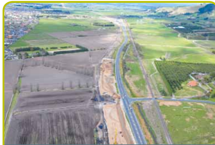
2 SH2 / Kairua Road intersection - Domain Road top of picture