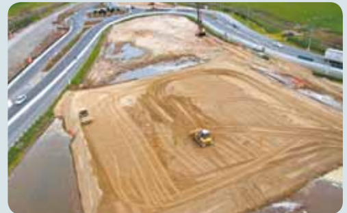
Three trial embankments will be constructed alongside SH2 similar to this one at Domain Road interchange.