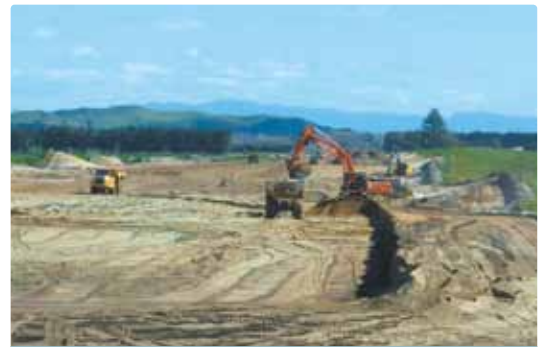
One of many areas the public won't see until the highway opens in 2016. The 'sand cut' is located between Parton Road and Kaituna River.