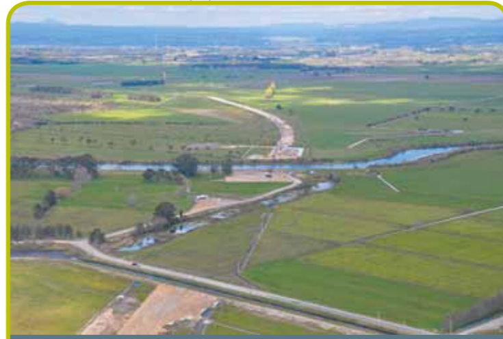
6 Location where TEL crosses Kaituna River heading east towards Paengaroa