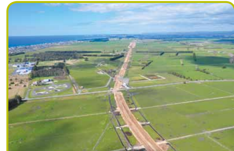
4 TEL alignment crossing Parton Road heading east towards Kaituna River