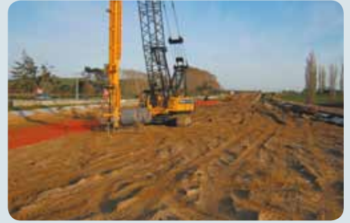
Over 15,000 wicks will be installed alongside SH2 to help drain the water content from the soft soil below.

From now until the end of the project construction activity will continue along SH2 and the NZ Transport Agency and Fulton Hogan HEB Construction Alliance wish to thank motorists for their care and patience when driving through this area.