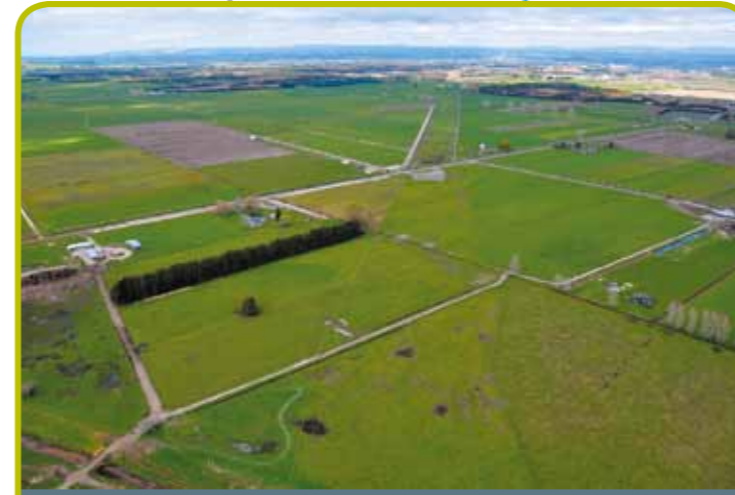
7 TEL alignment crossing Pah Road heading east to Paengaroa