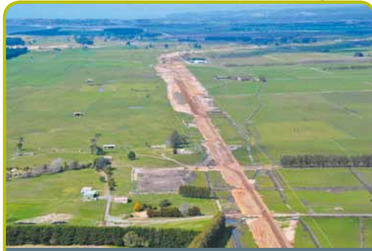
5 TEL alignment heading east towards Kaituna River